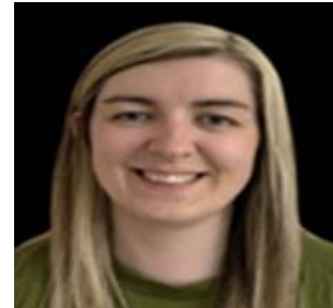
Miss Naules Languages