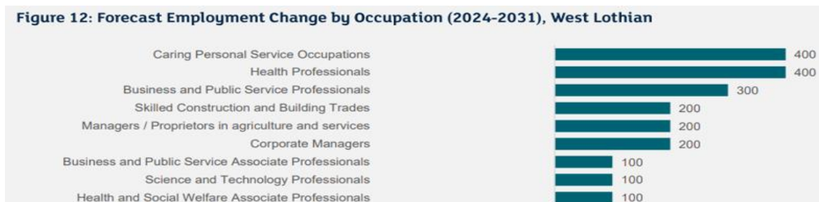
Figure 12: Forecast Employment Change by Occupation (2024-2031), West Lothian

With this in mind, the rationale for our curriculum is based on developing the skills, knowledge and attributes that will enable them to contribute successfully to the local community, context and labour market.